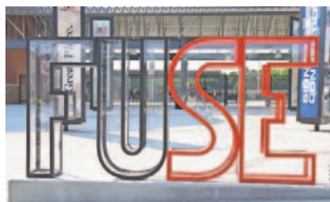
The abbreviation for Franklin Urban Sports and Entertainment (FUZE) greets fans as they enter the stadium now known as CaroMont Health Park.

want to see folks come back to the ballpark again and again, and not have to take out a loan to pay for concessions." He adds that his favorite food item here is the pulled pork sandwich with BBQ sauce.