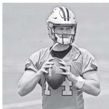
Sam Darnold gets a shot with a new team.

USA TODAY is committed to accuracy. To reach us, call 800-872-7073 or e-mail accuracy@usatoday.com . Please indicate whether you're responding to content online or in the newspaper.